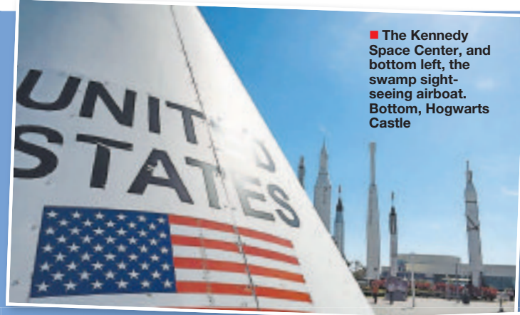
■ The Kennedy Space Center, and bottom left, the swamp sight-seeing airboat. Bottom, Hogwarts Castle