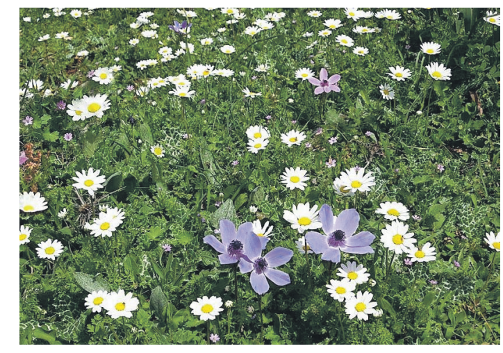
Spring flowers on Mount Akrimitis

For information about Walking Rhodes, visit www.walking-rhodes. com.