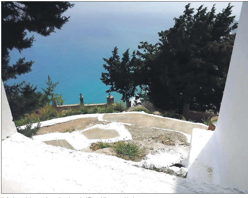
A view of the sea from the chapel of Tsambika, near Lindos

Discovering the varied influences that has shaped the Rhodes of today, its mythical folklore, hidden gems, beautiful views and a Belisha beacon oddity during a walking holiday